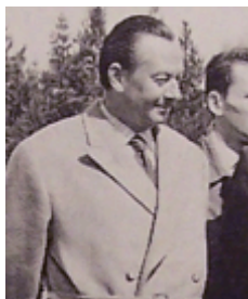
Julian Amery, who