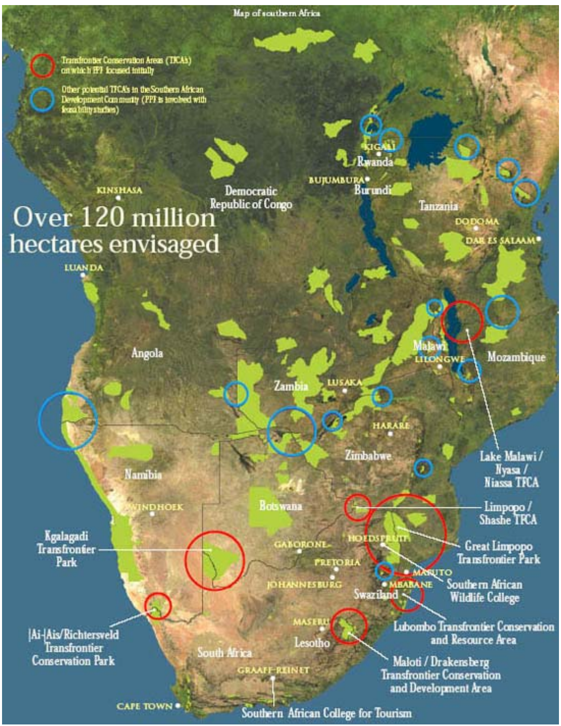
WWF map from a 2001. New parks have been created in the mean time.

Just a theory: it is possible that these so called 'strategic parks' might not be limited to Southern Africa. For instance, if you take a look at Pakistan, our "ally" in the War on Terror, you'll see five major national parks in the north of the country. One is located at the border with India, another at the border with China, and yet another one at the border with northern Afghanistan. The management of these parks works closely with the IUCN and the WWF. The Aga Khan Rural Support Program (AKRSP) of 1001 Club member Prince Sadruddin Aga Khan is another partner in many of the same projects in that area. It's hard to say if these parks are used for some type of military operations, but they certainly are conveniently located.