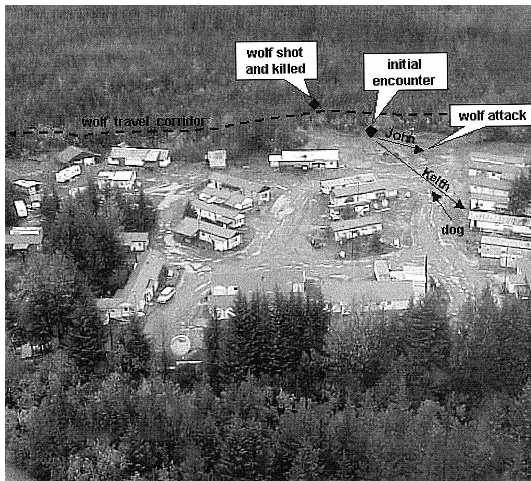
FIGURE 2. Aerial photo of the Icy Bay logging camp showing location of the wolf encounter and attack sites.

Over the next year, the collared wolf exhibited increasingly bold behavior. It was seen at least seven times by camp residents along the north perimeter of camp, on the road, and near the log sort yard. Between September 1999 and April 2000, people encountered the wolf at close range at least four times, but it never approached or demonstrated aggressive behavior toward people. However, the wolf was suspected in an attack that seriously injured a dog in summer 1999.