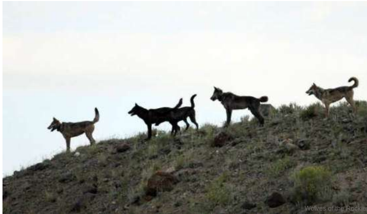
This August 2012 photo shows an image provided by Wolves of the Rockies of the Lamar Canyon wolf pack on a hillside in Yellowstone National Park, Wyo. The pack's alpha female was shot Dec. 6, in Wyoming, among at least five collared wolves from Yellowstone killed by hunters this fall. Four more wolves collared in the park but no longer living there also have been shot.

December 14, 2012 4:00 am • By Erin Madison - Tribune Staff Writer