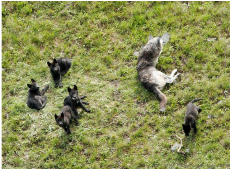
Two-month-old pups relax with their mother in Yellowstone National Park.

December 09, 2012 5:00 pm